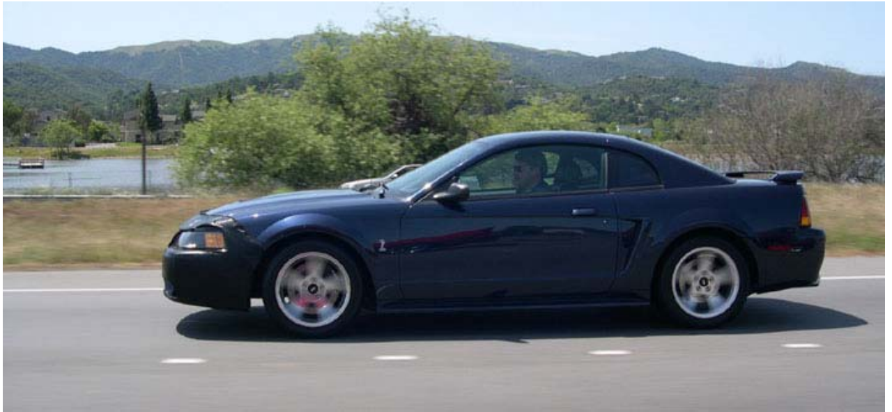
Sweet and Low