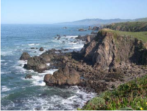
Why it's called the Shoreline Highway.