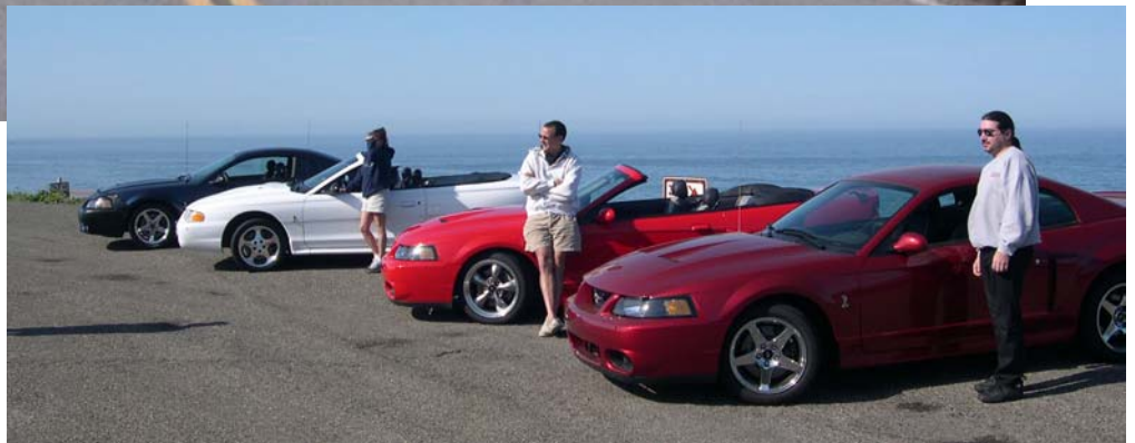
The Usual Suspects (right)