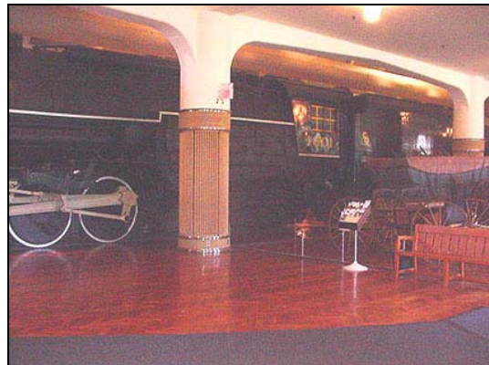
(Here is another train that made you wonder how they ever got it in the museum).

Unfortunately, the camera's battery was getting low so we had to cut the pictures short and save them for the Greenfield Village photos.