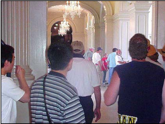
(The museum was huge and had lots to see)

On Saturday, we split up and went to do different events. Our trip would not be complete unless we took a trip to the Henry Ford Museum. Another ride in an air-conditioned bus and we were on our way.