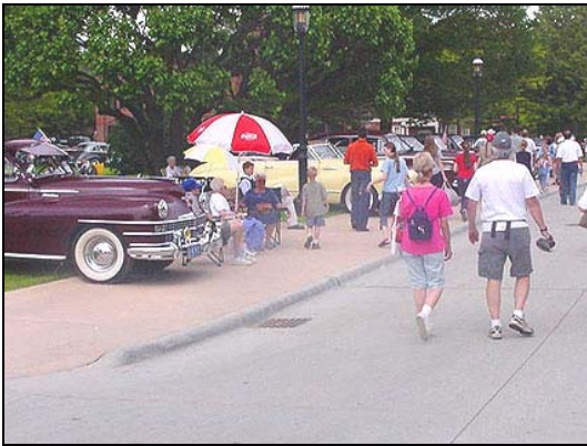
(There was a car show going on during the event)

Greenfield Village had just been remodeled and the town looked great. You felt like you were back in the "good ole" days. There were more cars lined all over the village than anyone could count.