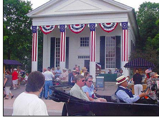
(The houses were all dressed up and the street were crowded with visitors)

There was a car show going on during the event and again you would think it would be all Ford cars but it was an open show. The show included all makes and models of vehicles including Dodges, Chevilles, Oldsmobiles, and even Buicks.