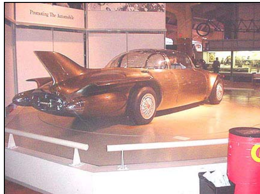
(Cool looking Rocket Car)

There was a huge array of cars ranging from the early 1900's to the present Thunderbird. One thing that was noticed was that not all of the cars were Fords. There was all kind of brands that were on display ranging from Nash Rambler's to all sorts of Army jeeps.