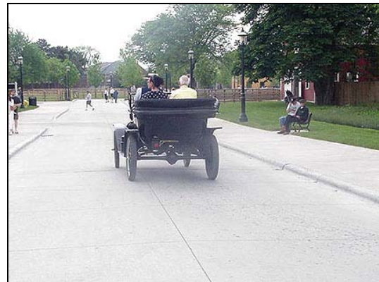
(This couple opted for a Model T ride)

The above picture doesn't do the event justice, as the streets were full of visitors and spectators. You could even get some rides on a few of the attractions. There was a steamboat, train, boats, and even a merry-go-round.