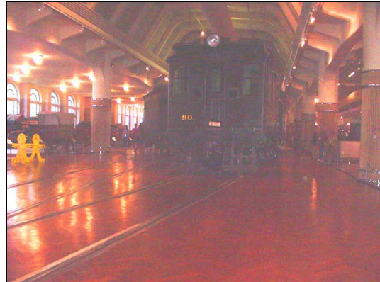
(The trains were on their own tracks)

track "turnaround" where the trains could be turned in the opposite direction.