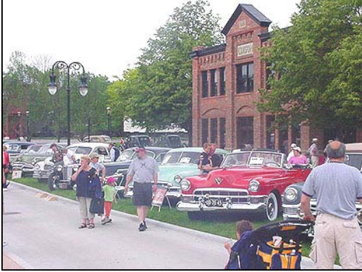
(This was a really cool town)

Greenfield Village had just been remodeled and the town looked great. You felt like you were back in the "good ole" days. There were more cars lined all over the village than anyone could count.