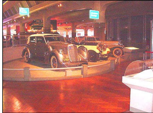
(There were a lot of cool cars on display)

anyone could stay in this car for so long and come out a champion?