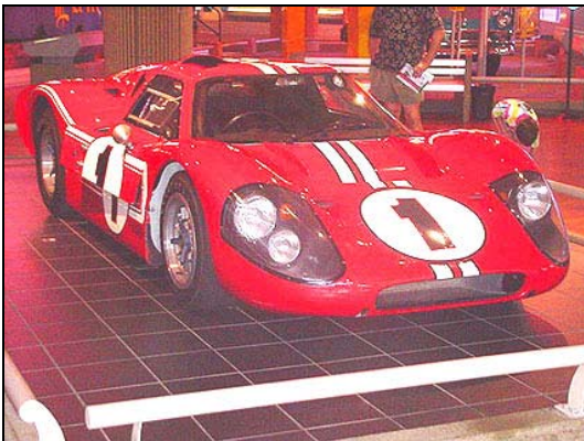
(This GT 40 was raced back in the 60's)

As we walked into the museum we were overwhelmed by decorative hallways and crystal chandeliers.