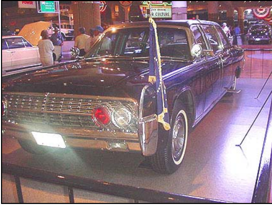
(This is the actual car that John F. Kennedy was riding in when he was assassinated)