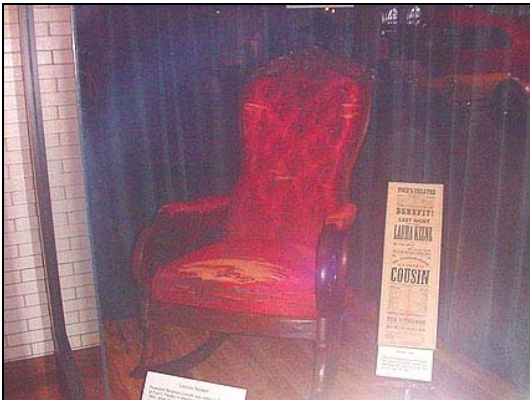
(Abraham Lincoln was sitting in this chair when he was assassinated in Ford's theater)