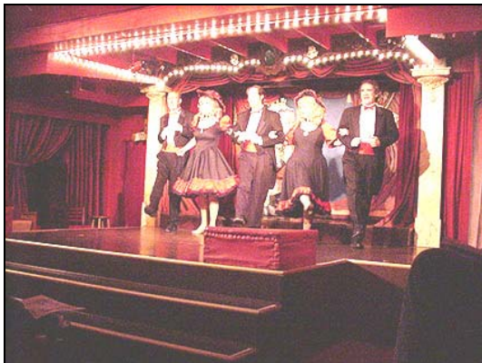
(The cast doing a dance up on the stage)

The theater is small and seats about 250 people but the fun was about to begin when the small group gathered for the show. We had 31 members attend the event and our club was recognized by the theater at the end of the show.