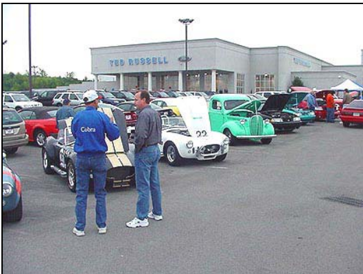
(Lots of great stories are told at car shows)