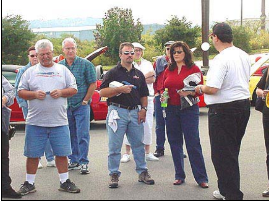
(Everyone was checking numbers while we gave out the door prizes)