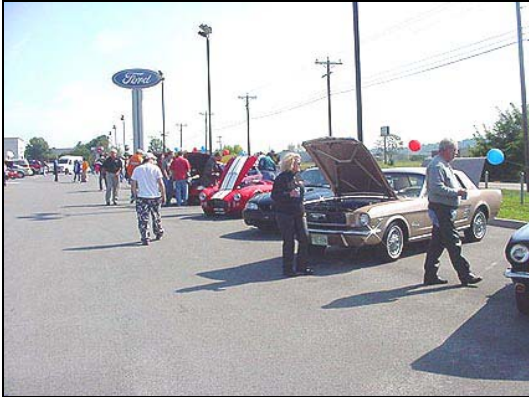
(We had several older Mustangs at the event)