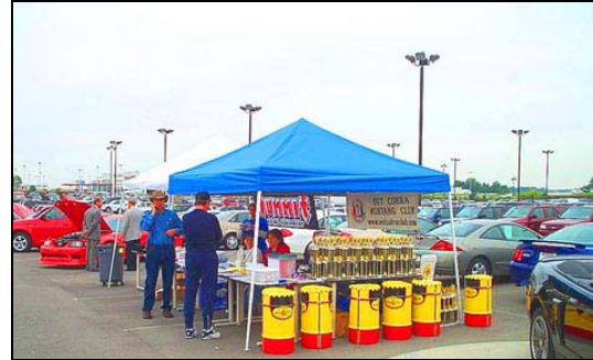
(We had our show tent set up and ready to go)