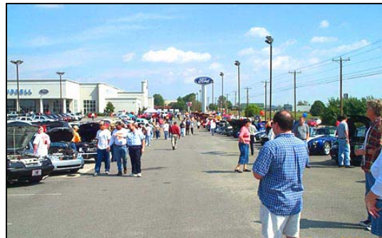
(The crowds got thicker and thicker)