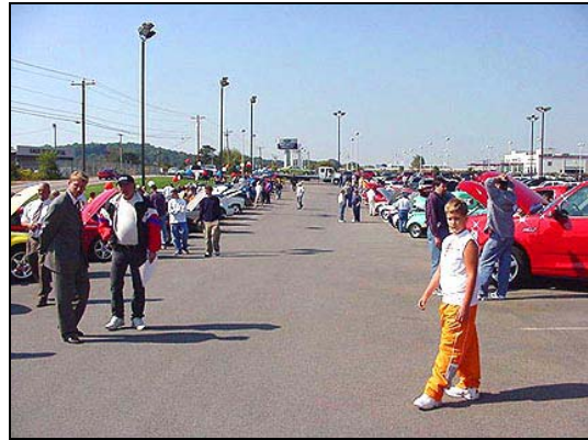
(Cars were lined up facing each other diagonally)