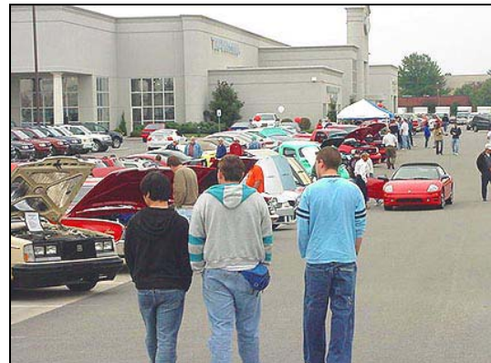
(We had lots of spectators at the show; several Cobra owner on-lookers joined the club)