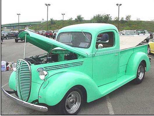
(Jimmy Casteel brought his 1938 pick up truck to the show)