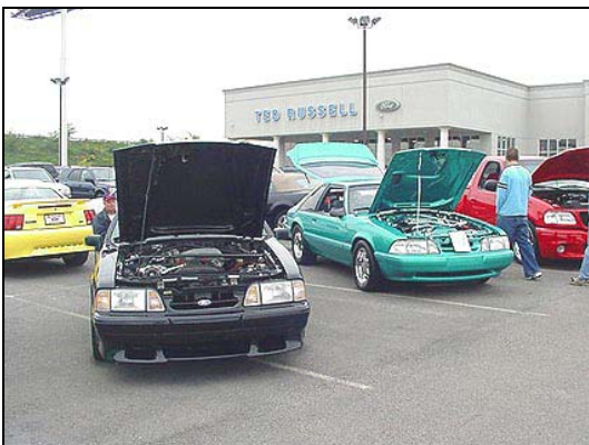
(There were several fox bodied Mustangs and Lightnings at the show)